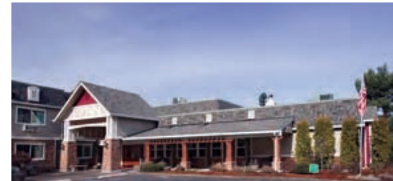
SENIOR INDEPENDENT LIVING