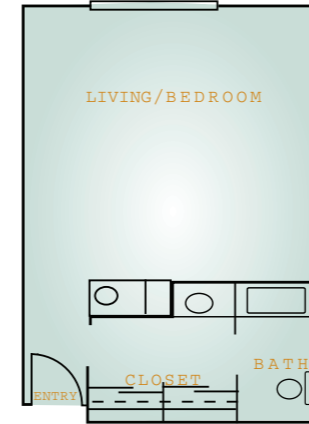
STUDIO • 400 SQUARE FEET